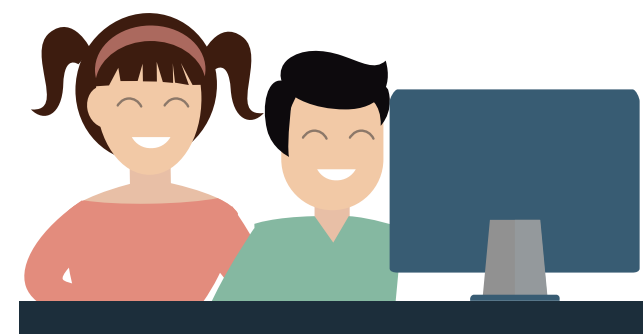
S.U.R.E. for School

S.U.R.E. for Life aims to educate the general public on the threats that deliberate online falsehoods pose to the peace and stability of society.