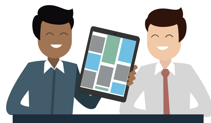
S.U.R.E. for Work